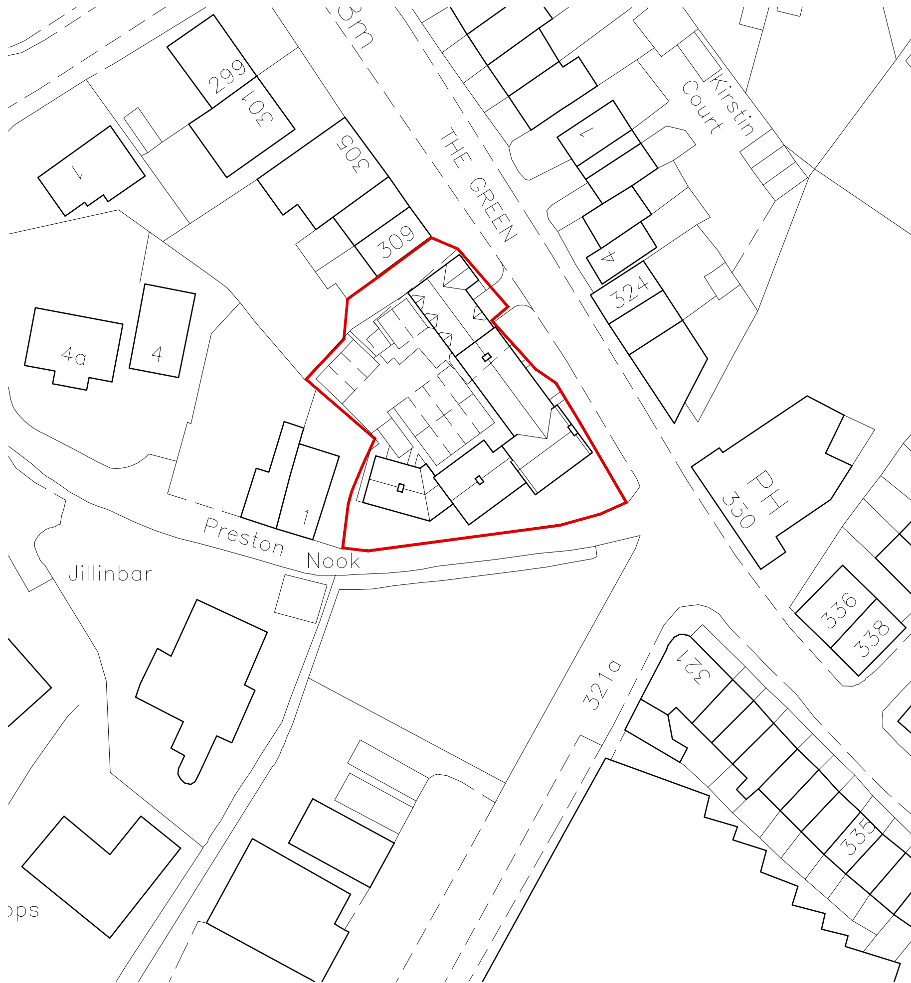
Site Layout 1:500 0m 25m 50m Scale: 1:500