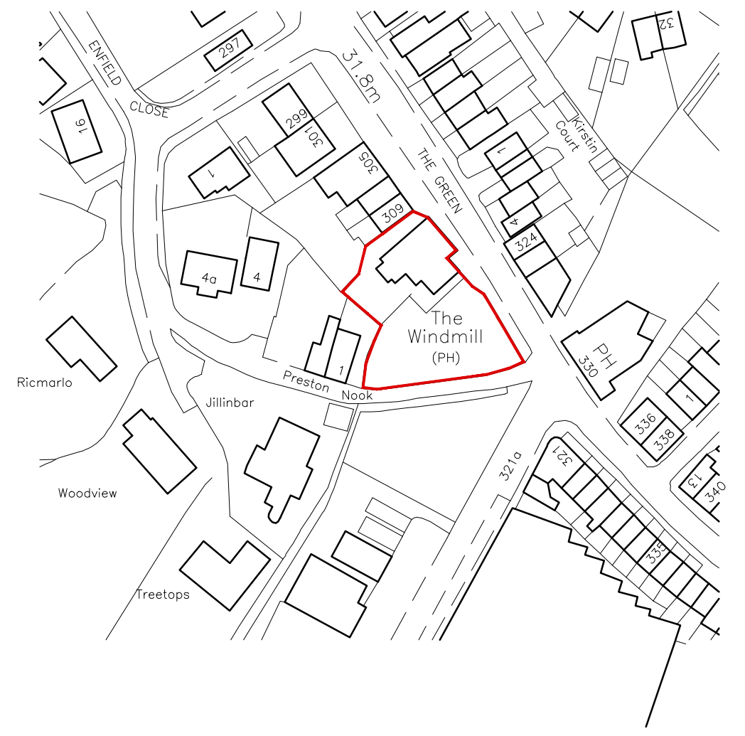
Location Plan 1:1250 0m 125m Scale: 1:1250